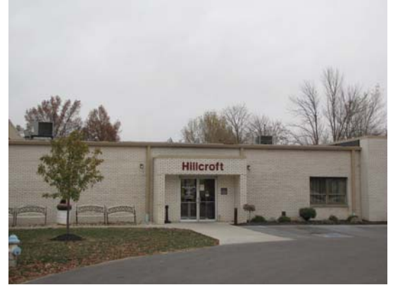
Hillcroft Streeter location.