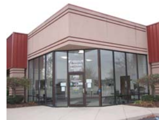
Hillcroft's Walnut Street location