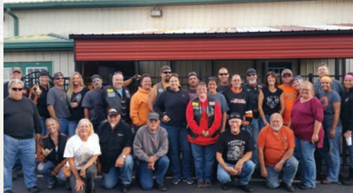
Tuesday Night Summer Ride