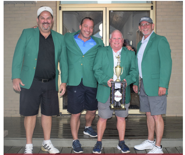
Thursday Winners: JTSC Telecommunications