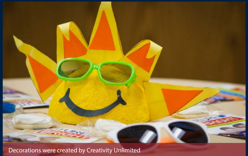
Decorations were created by Creativity Unlimited