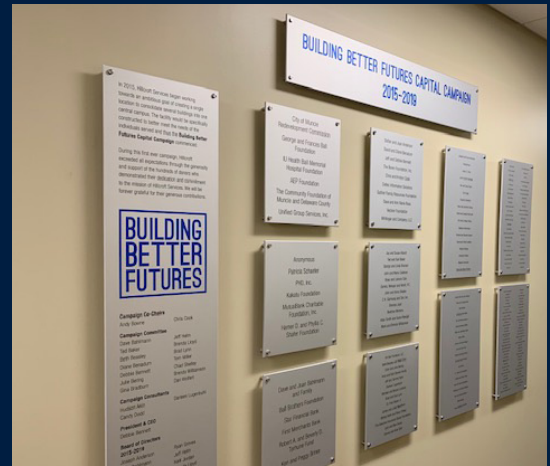
Building Better Futures Capital Campaign Donor Board