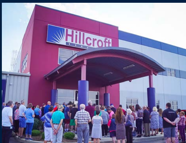
Guests gather around main entrance for Ribbon Cutting Ceremony

one of several guided tours that took the 200+ attendees around the new 85,000 square foot facility to learn more about all the services Hillcroft provides and to see first-hand the brand new facilities. The tours ended with a lively reception in the Creativity Unlimited area where appetizers and refreshments were prepared and served by the Ivy Tech Culinary School and was accompanied by more Music Therapy entertainment and the opportunity to purchase arts and crafts made by Hillcroft clients.