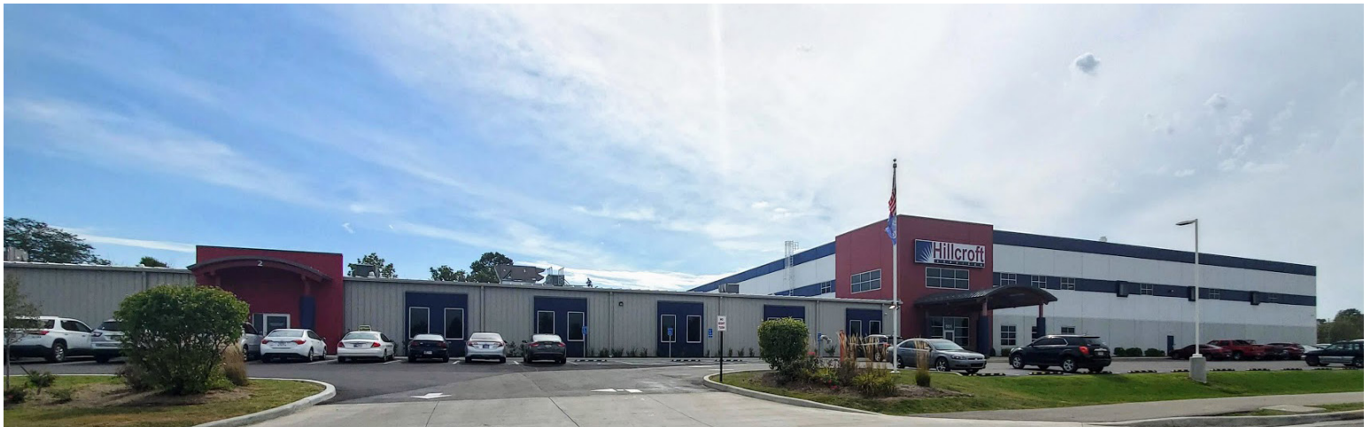
Recently completed 45,000 square foot addition to the pre-existing two story 40,000 square foot building creating 85,000 total square feet

Four years ago, Hillcroft Services set out with a vision of consolidating multiple buildings in order to create one main campus which would offer more space and better amenities to help provide better and improved services for our clients. Thanks to the generous support and the hard work of so many individuals, companies, and foundations, this dream has now become a reality. Over the past few months, Hillcroft staff and clients have been adjusting to life in their new facility. It has been both an exciting and uncertain transition for many but the facility that they now call home was all worth it. Hillcroft clients and staff are happier than ever before as they are able to utilize this expanded, state of the art facility. As was their hope, by consolidating services into one main campus, Hillcroft is now able to better serve their clients with greater accessibility and efficiency.