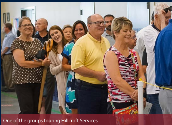
One of the groups touring Hillcroft Services