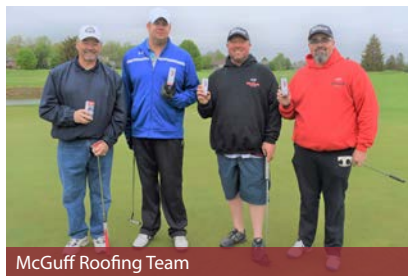
McGuff Roofing Team