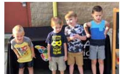
First four students of the Hillcroft ABA Clinic Preschool on their first day. They were so excited to see what was in store.