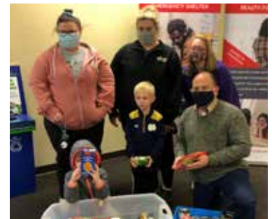
The preschool was able to support the community and the Muncie Mission with a canned food drive. For being so young the students rocked in the subject of giving by bringing in over a hundred canned goods which went to the Muncie Mission Thanksgiving meal.