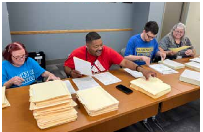
Lifestream Services is one of our partners that has provided volunteer opportunities for our clients and their job coaches for the last two years. A few of their tasks include organizing files and assembling volunteer packets.