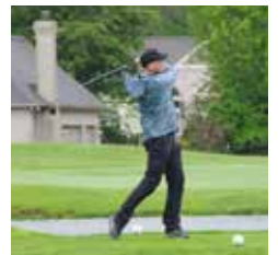
Thursday Champions JTSC